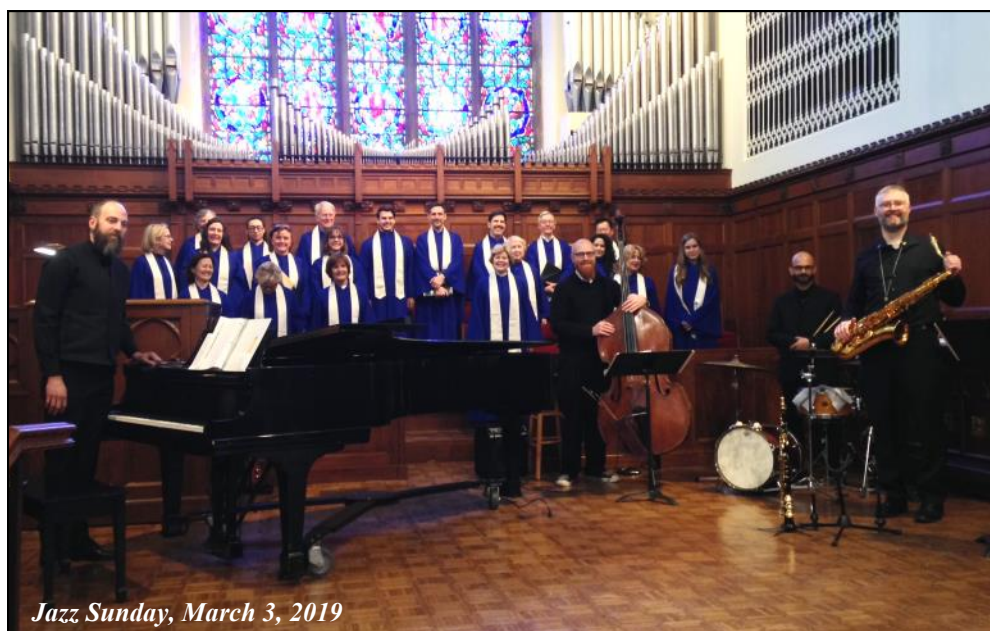
Jazz Sunday, March 3, 2019

Rye Presbyterian Church 882 Boston Post Rd. Rye, NY 10580